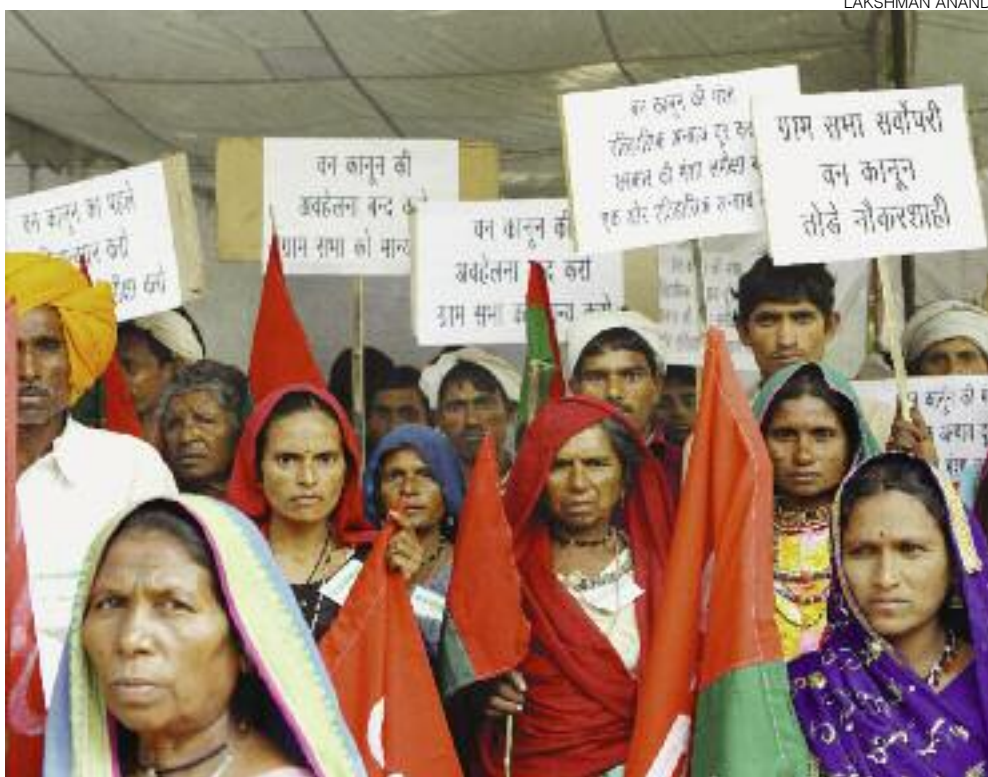
Adivasi women protesting in Delhi over poor implementation of the Forest Rights Act

The Union Home Ministry's offensive against the Maoists took off under a cloud of controversy. Human rights groups roundly condemned armed action by the State. The Maoist insurgency is raging in the tribal regions of Chhattisgarh, West Bengal, Jharkhand, Orissa and Maharashtra.