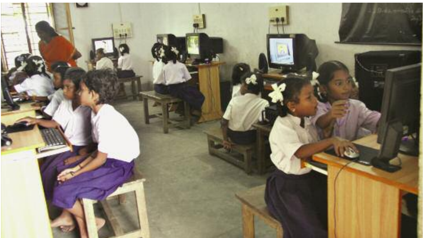
Computer lab for children