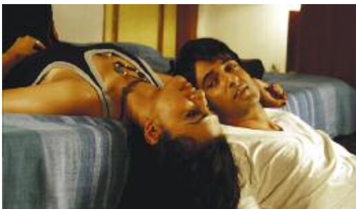
Sanjay Suri and Radhika Apte in I am Abhimanyu