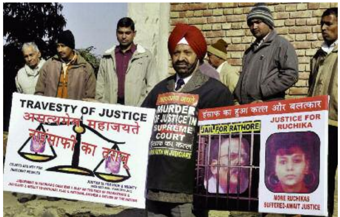
Local residents protesting outside the Panchkula district court against former Haryana DGP, SPS Rathore, convicted in the Ruchika molestation case

But police reforms continue to be in the doldrums despite Supreme Court orders to states to improve the functioning of the police, insulate them from political interference and set up Complaint Authorities to tackle human rights violations.