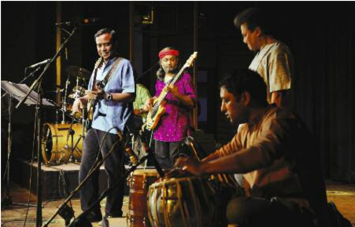
Indian Ocean plays its earthy music

There is a lot of Indian culture which has global appeal – foot-tapping music, vigorous folk dance, spicy cuisine, art, funny puppets, fashion and Bollywood. After a long hiatus the Indian Council of Cultural Relations (ICCR) has revived the Festivals of India which were so popular decades ago.