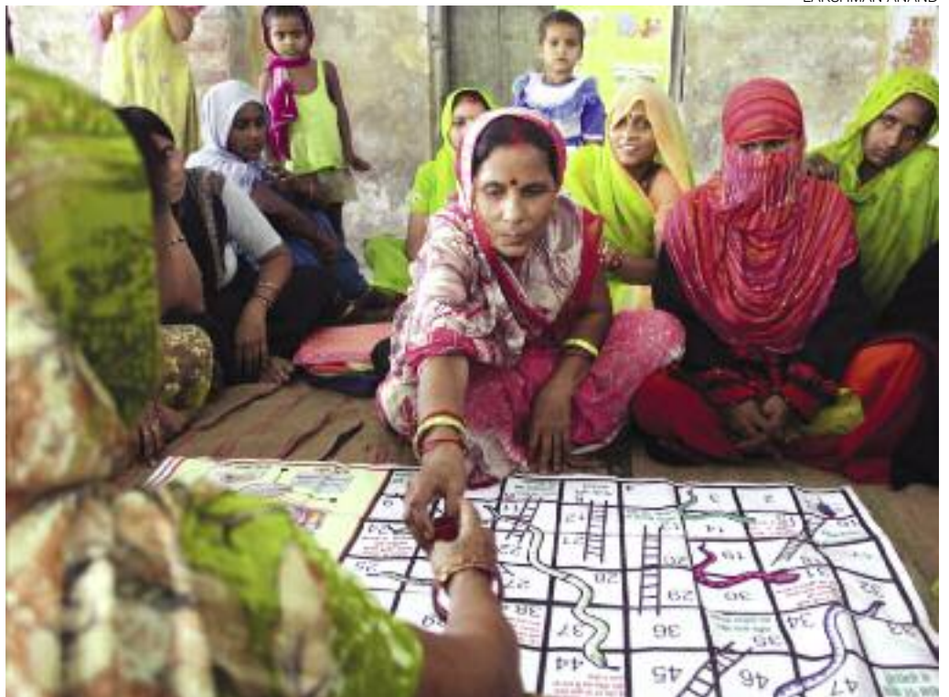
A game of snakes and ladders educates women about their health

The pictures above and right show the Ashas at work, reaching out to rural women with instructional toys and games.