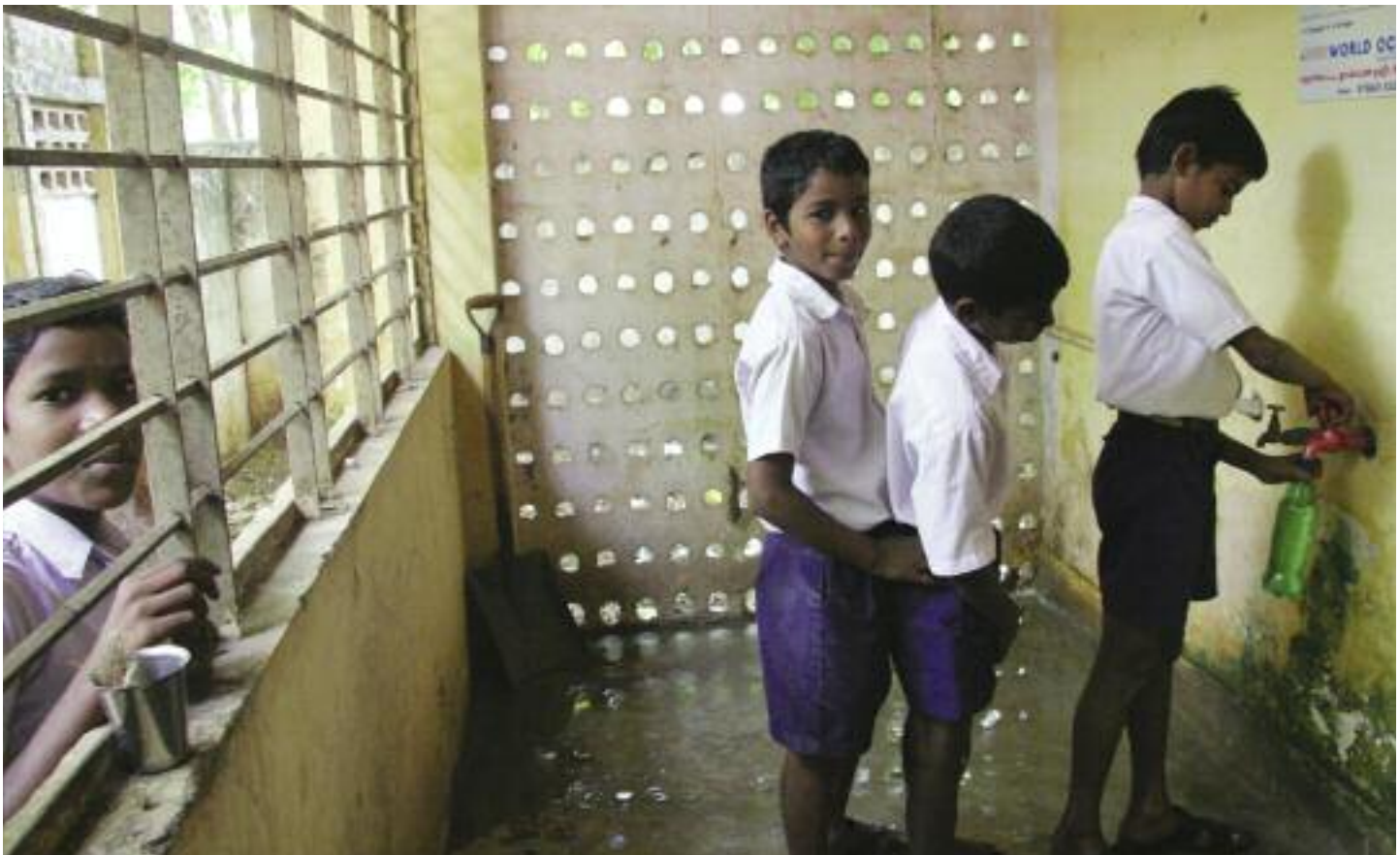
Children are encouraged to take clean drinking water home

"Teachers are God's gift to society," he says. "They should work with dedication. I too hail from a very poor background but I never gave up."