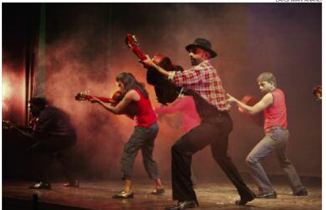
Scene from the Sri Lankan play, Colombo, Colombo

Overall there was a celebratory mood. Despite language difficulties, the performances were appreciated. There was a lot of messaging on social issues. Each country had something to say about its own society.