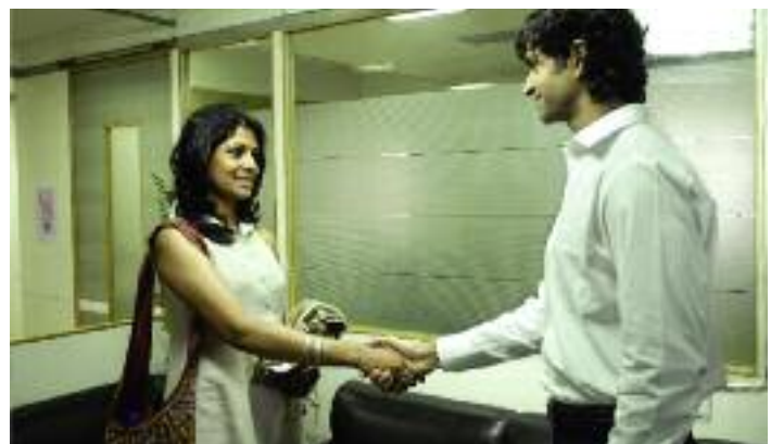
Nandita Das and Purab Kohli in I am Afia