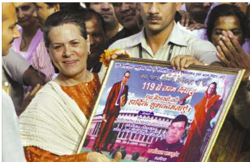
Sonia Gandhi with a portrait presented to her by Bhimrao Ambedkar's followers on his birth anniversary

Last time around the NAC gave the nation laws like the right to information, employment guarantee and forest rights for tribals and forest dwellers. This time too new laws are on the anvil but the accent is also on implementation and making the system work better.