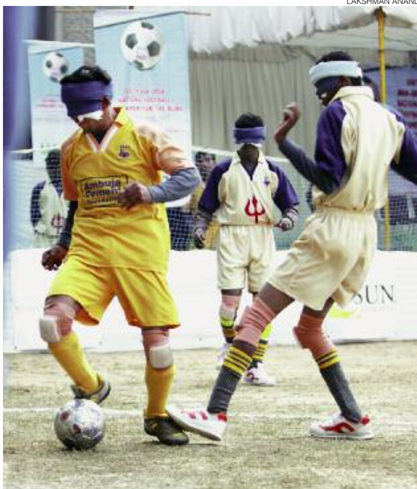
A tense moment in the match between the teams from Jodhpur (in yellow) and Madurai

Football played by the blind can be noisy. The managers of the two sides stand behind the goal-