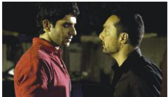
Rahul Bose and Arjun Mathur in I am Omar