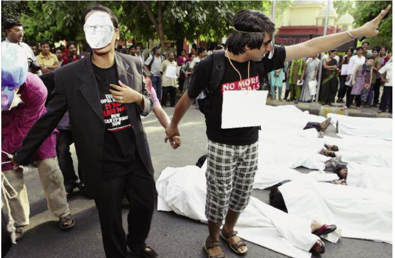
Protests erupted in New Delhi over the court's verdict in the Bhopal Gas Tragedy case.