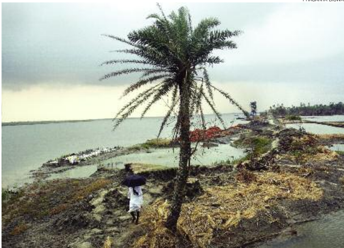
The sea is swallowing the Sunderbans

Islands in the Sunderbans region of West Bengal are disappearing one by one. The reason is sea rise caused by global warming. Ghoramara, Lohachhara and Suparibhanga islands have already been swallowed by the rising waters of the Bay of Bengal. Cyclones are increasing in ferocity. Last year Cyclone Aila devastated the Sunderbans. The swirling waters of the sea make the land turn saline and unfit for agriculture or for drinking. Millions are expected to become homeless in the coming years. There is no land available for resettling climate-change refugees.