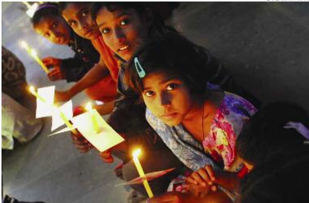
The Equal Education for All campaign

The new law was welcomed by NGOs working for child rights. But they wanted the ambit of the law to be widened to include children below six and those between 15 and 18. Child Rights and You (CRY) led a national campaign Sabko Shiksha, Samaan Shiksha (Equal Education for All) collecting signatures from 20 cities and 6,700 slums and villages. The campaign's Charter of Demands asked the government to ensure that there were schools in every neighbourhood equipped with qualified teachers, infrastructure and facilities for underprivileged children. It demanded the government increase its GDP spend on education. The Union government has now increased funding to states for implementation of this law.