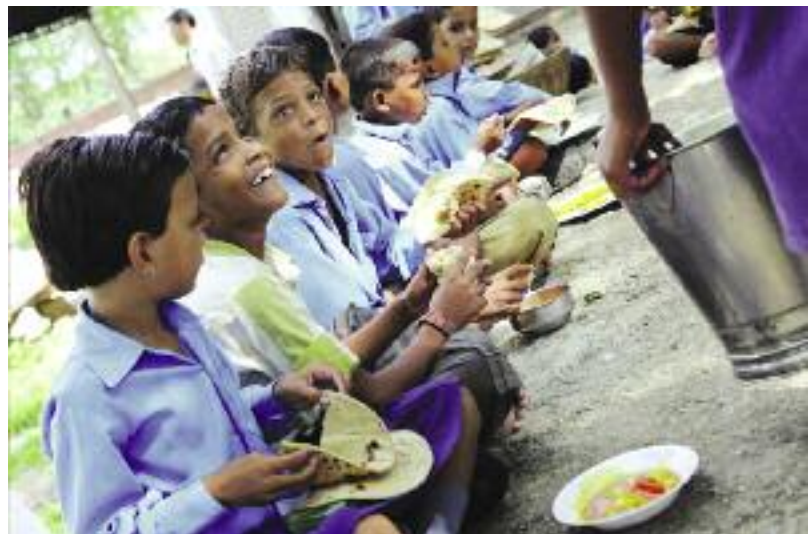
A midday meal in progress

This has enabled them to continue their studies.