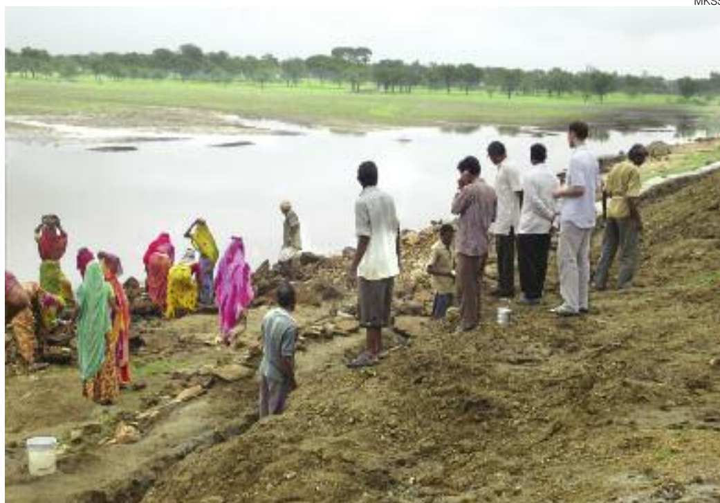
Women at a MNREGA site. And below: Work on a water structure in Bhilwara