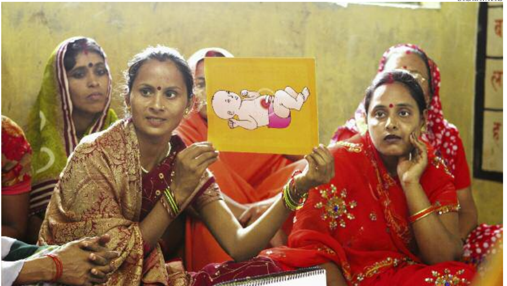
Ashas at an anganwadi centre in UP demonstrating safe birthing practices