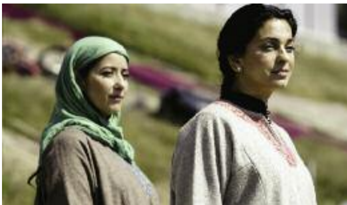
Manisha Koirala and Juhi Chawla in I am Megha