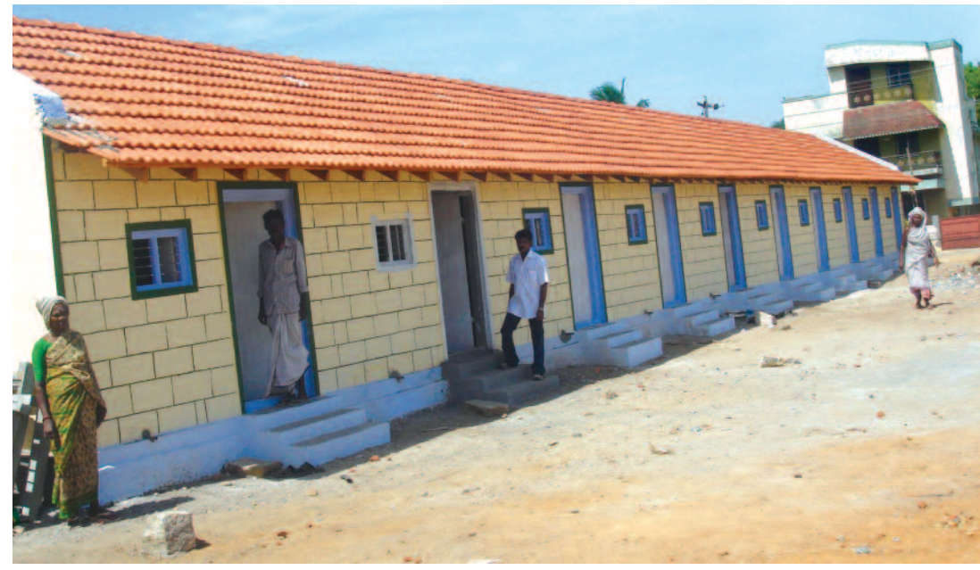
A low-cost housing project

The next big hurdle in the way of affordable housing is the rising cost of materials and construc-