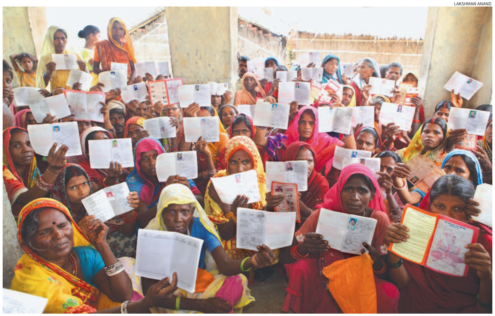
Rights matter: Women hold up their job cards in Muzzaffarpur

ernments can ignore its provisions with impunity. Following the failure of delivery systems, it was thought that people would be a driving force that would ensure efficiency and end corruption. However, the failure to genuinely empower people is now being used to discredit rights-based paradigms. Rejecting the rights-based paradigm has unhealthy implications for participatory democracy and the capacities of the poor to define their own solutions.