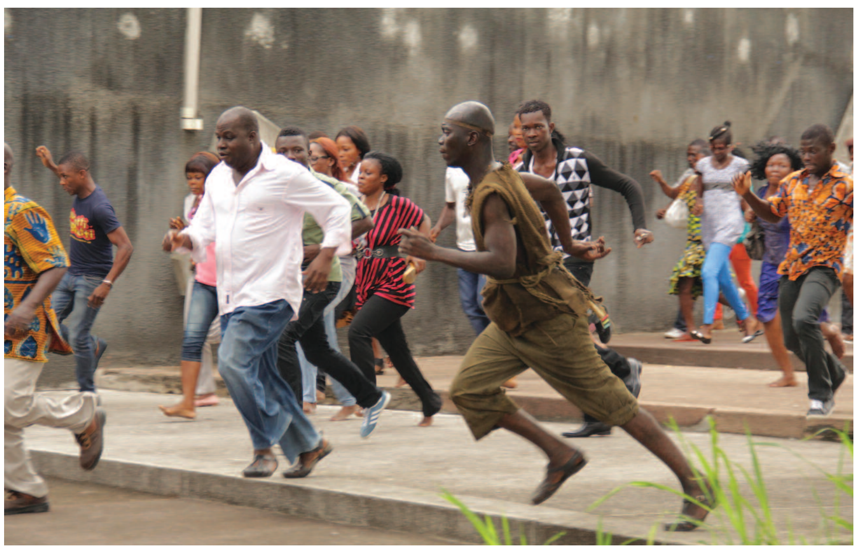
Run is the story of a young man who wants to become a rainmaker but gets sucked into a violent conflict instead