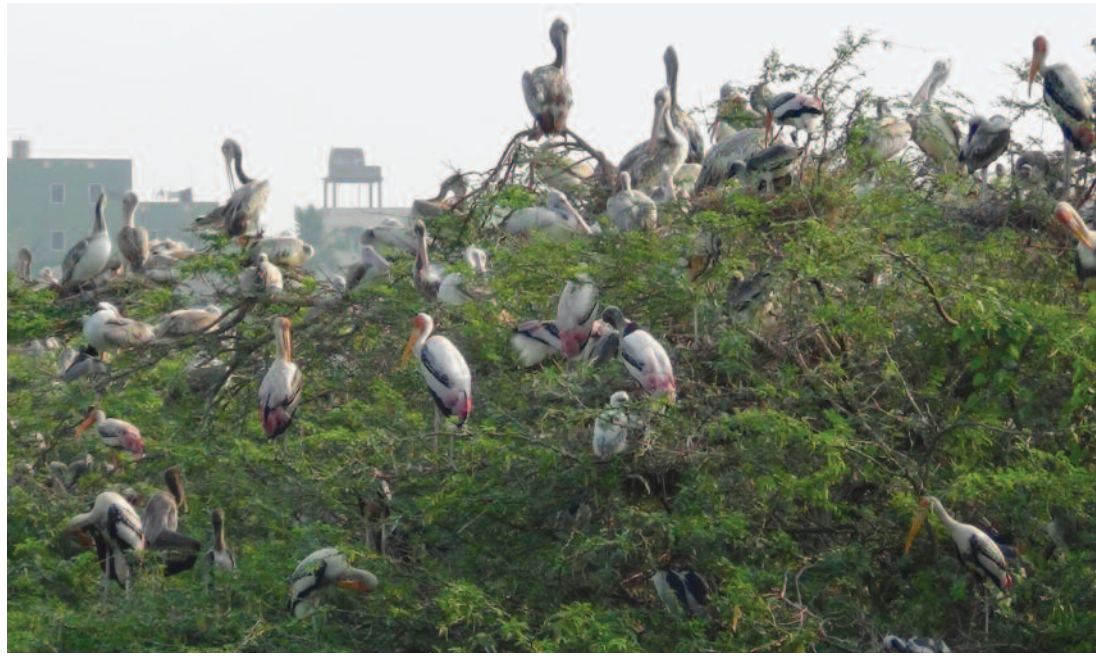
Villagers have created a safe environment for migratory birds

Indeed, bird migration is now in such large numbers that forest conservation authorities are being forced to consider how they might increase the size of the sanctuary and provide more mounds to house the birds. When we visited Uppalapadu in February, on just one mound, there were literally