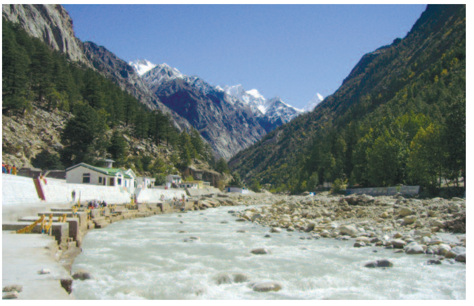
Silt is as important as water for the health of the river, its floodplains, delta and wetlands

One of the key elements that a river carries is silt or sediment that it accumulates along its journey from the hills to the delta where major rivers meet the sea. Along its route the type, quantity and movement of silt a river picks up varies with place and time. Silt is of different forms: it could be suspend-