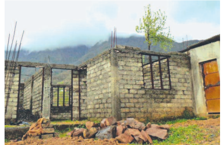
A primary school without a roof in the border district of Poonch

In Marhote village of Surankote block in Poonch district, for instance, a primary school was established in 2004 under the SSA as an Education Guarantee Scheme Centre. Till 2008, it provided school education without a building. Teachers, appointed on a salary of ₹1,000 a month, did not receive any monetary compensation for nearly four