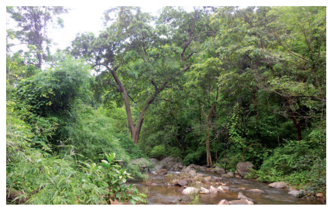
New rules put the onus of completing processes heavily on the district administration

The issue of who is the final authority in deciding