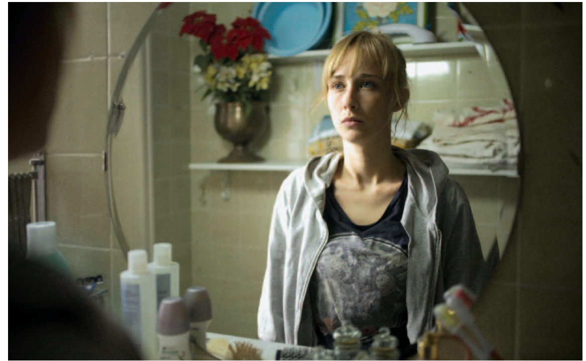
Beautiful Youth addresses the theme of economic deprivation