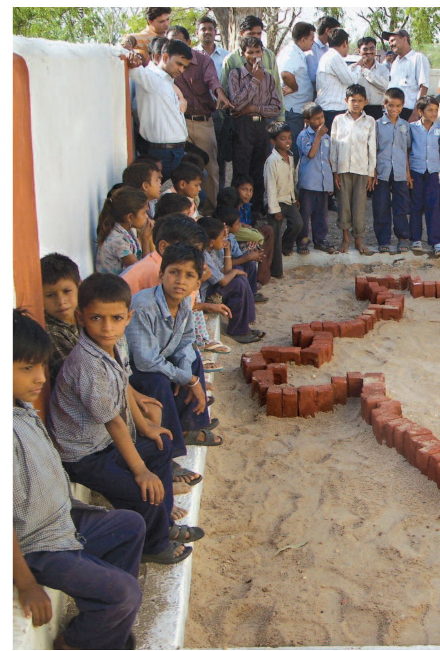
India's future: Education for all at a young age

♦ Improve human resource planning and management. The absence of HR planning skills has negatively impacted several health policies.