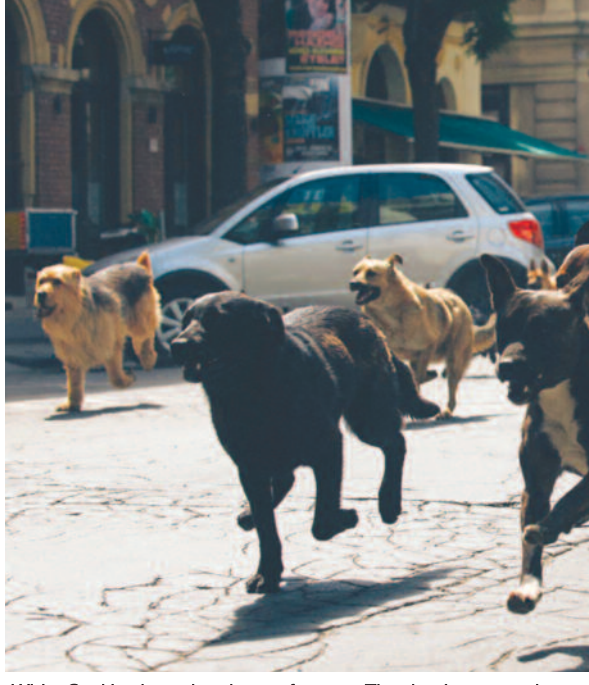
White God is about the abuse of power. The dog is a metaphor

Given the predominance of stories of communities under siege, it was fitting that among a bunch of great documentaries unveiled in Cannes this year was The Salt of the Earth, an exploration of the work of leg-