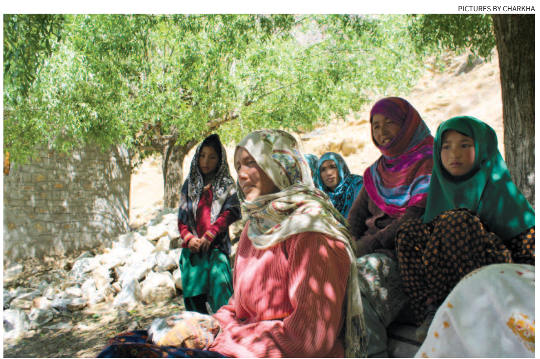
ASHAs don't have access to training and earn meagre sums as incentives in Kargil district