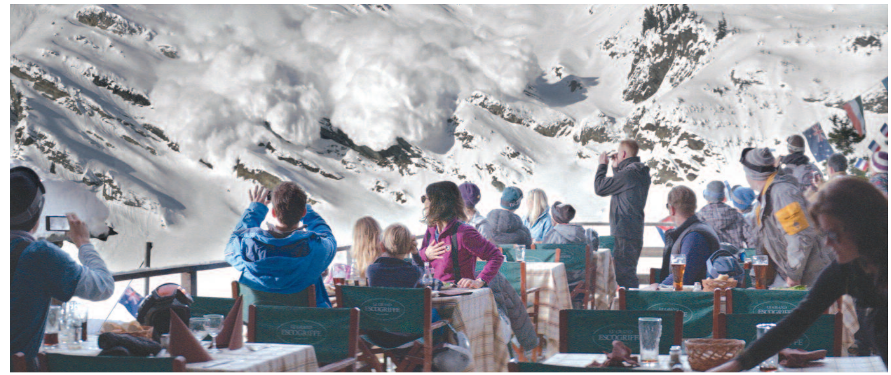
Still from Force Majeure: a seemingly perfect family man is forced to look within