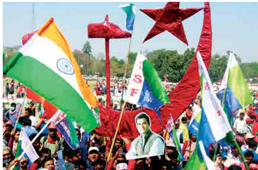
A sea of flags at the Left Front, Congress, Indian Secular Front rally in Kolkata