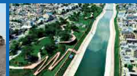
Dravyavati River, Jaipur - 18,000 trees planted and 65,000 Sq.M green area developed