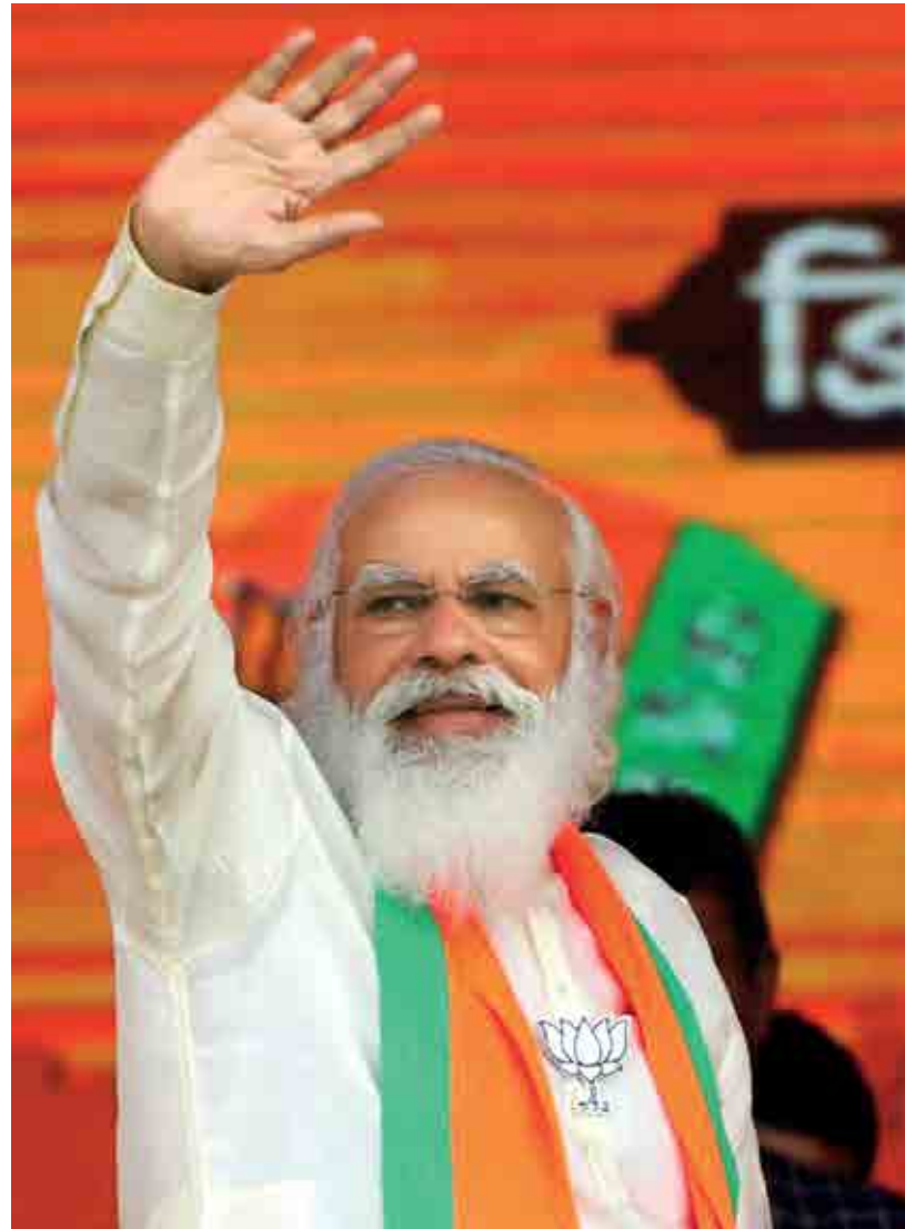
Narendra Modi at a rally: Appealing to Bengali asmita