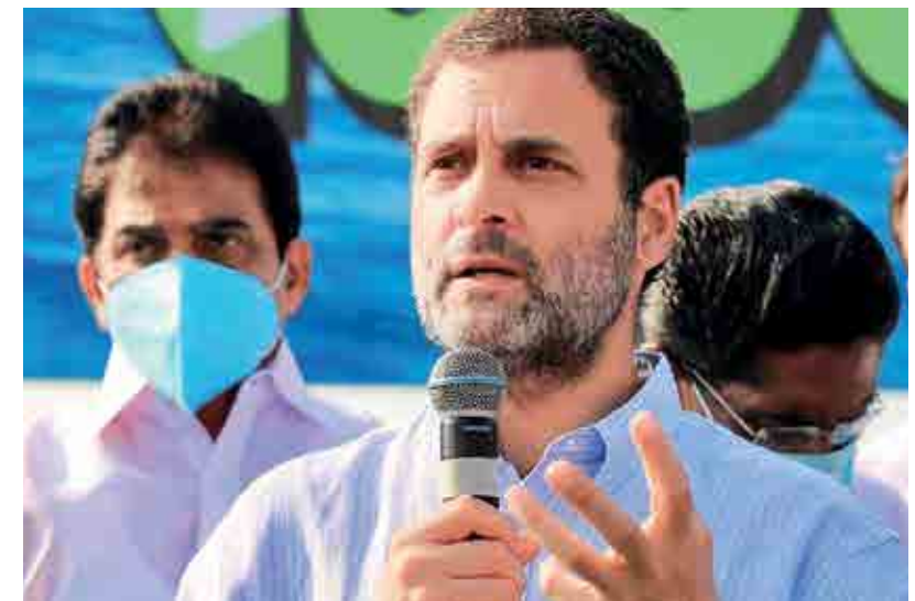
Rahul Gandhi campaigning: Congress is a marginal player