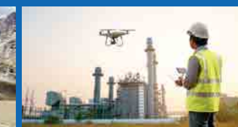
212 Projects under execution