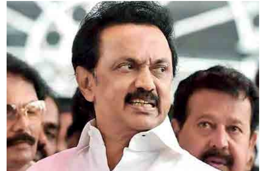
M.K. Stalin of the DMK. Tamil Nadu epitomizes powerful regional loyalties

In Tamil Nadu the BJP hoped to tap into regional sentiment by attracting film star Rajinikanth to its side. Rajinikanth's withdrawal from politics after several years of contemplation, ostensibly on health grounds, has left the BJP stranded. The DMK and AIADMK have always been fair weather friends of national parties in power in New Delhi. Both have been in alliance at one time or another with both the BJP and the Congress. Hence, the contest in Tamil Nadu remains