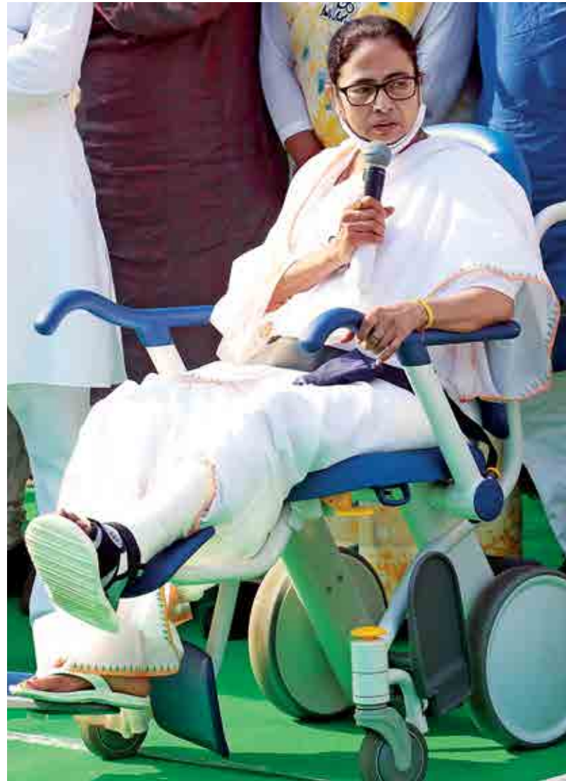
Mamata Banerjee in her wheelchair: Holding sway over Bengali sentiment