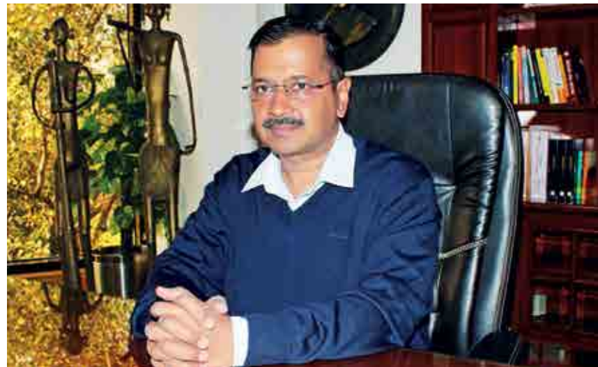
Chief Minister of Delhi, Arvind Kejriwal, has proved the BJP is not invincible

The results of the 2021 assembly elections will shape the future dynamics of the national vs regional debate. If the TMC, DMK, Left Front win in West Bengal, Tamil Nadu and Kerala it will spur a wave of coalition politics.