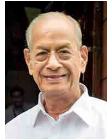
E. Sreedharan: Malayali pride?