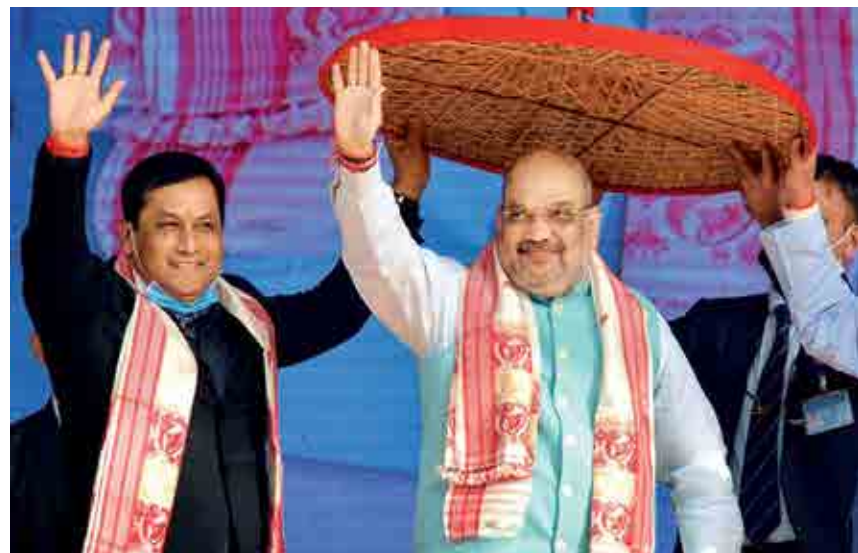
Chief minister of Assam, Sarbananda Sonowal, with Amit Shah