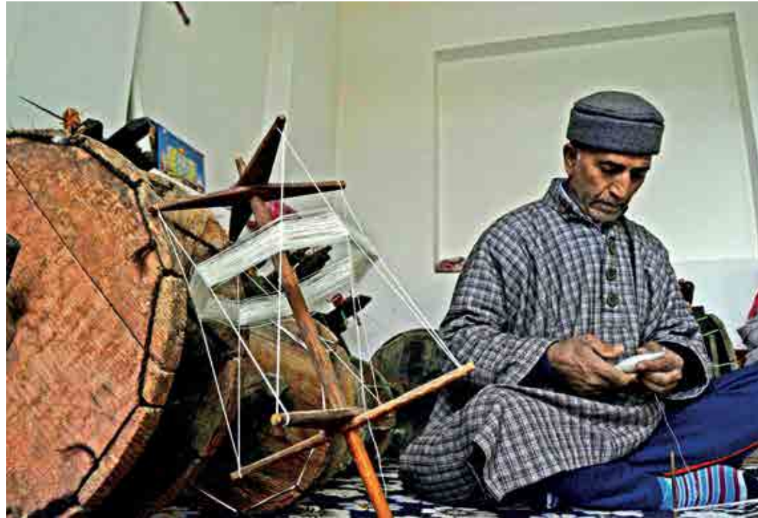
A pashmina weaver at work spinning delicate threads into fine fabric