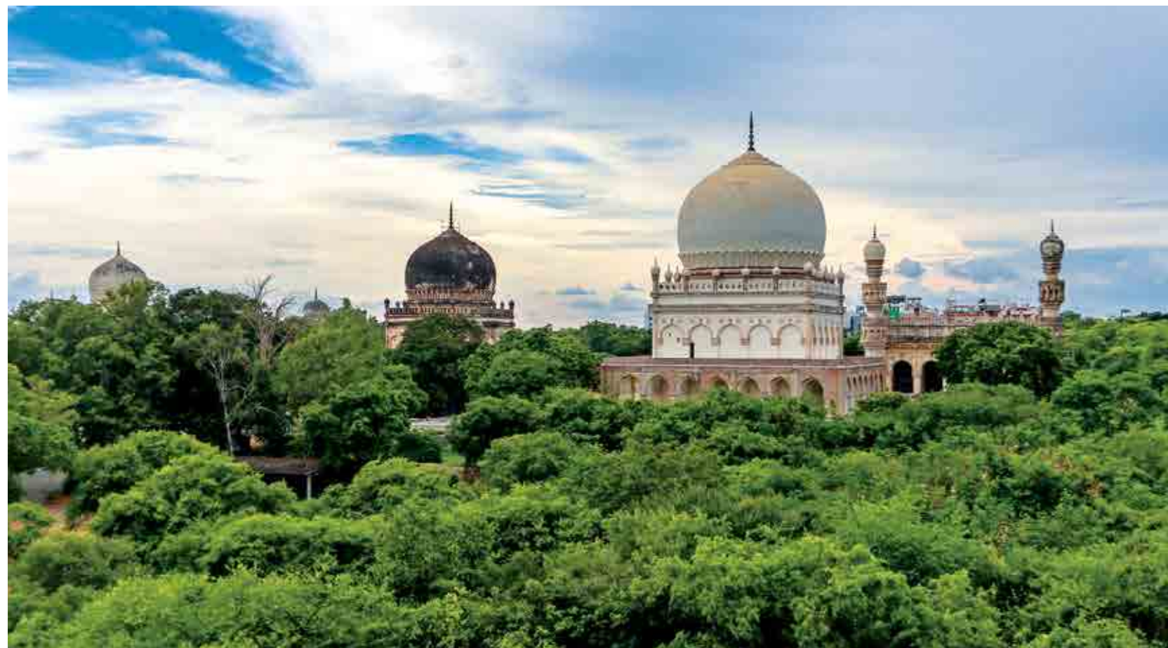
Qutb Shahi tombs amidst 106 acres of greenery near the Golconda Fort