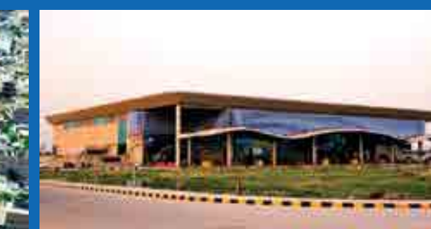
Prayagraj Airport, built in record time of 11 months