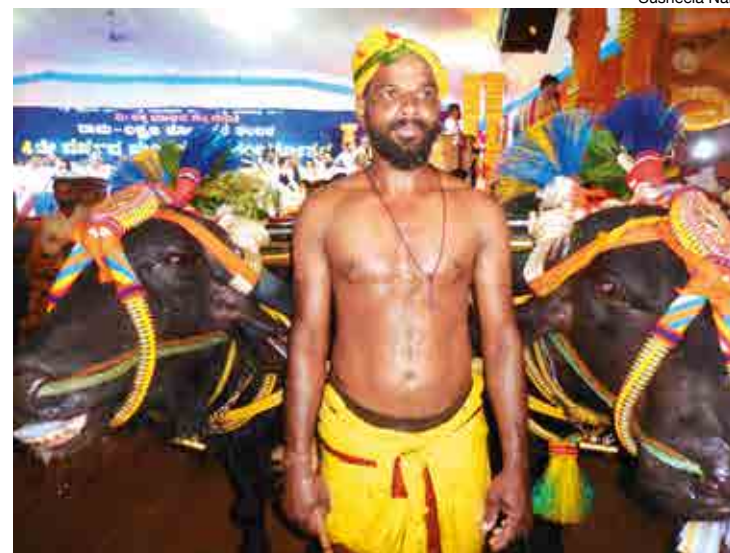
A Kambala jockey with his pampered buffaloes

Preparations for the mega event start months in advance. Utmost care is taken to choose the best animals and the selected ones are made to go through rigorous training under a team of specialized jockeys. The valuable buffaloes are