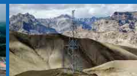
India's highest Transmission Line (13,500 feet)