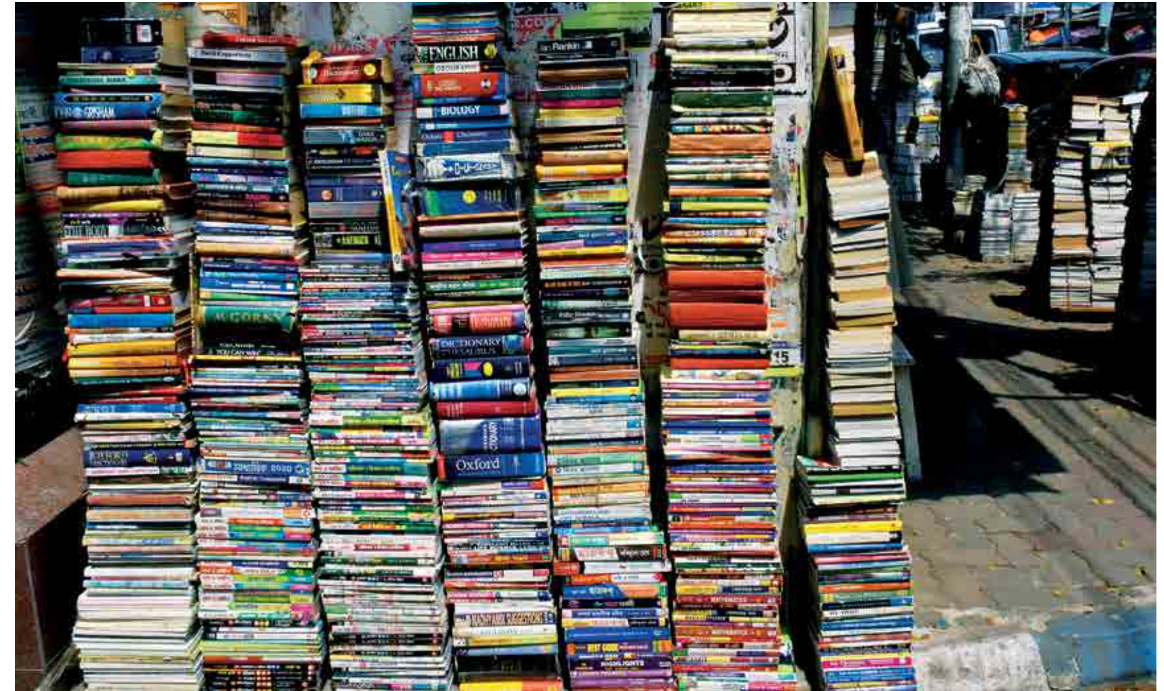
Piles of secondhand books on a street in Kolkata

And, most importantly, the teachers must be given enough time to compensate for both kinds of learning loss – and we must not rush into promoting children to the next class. ■