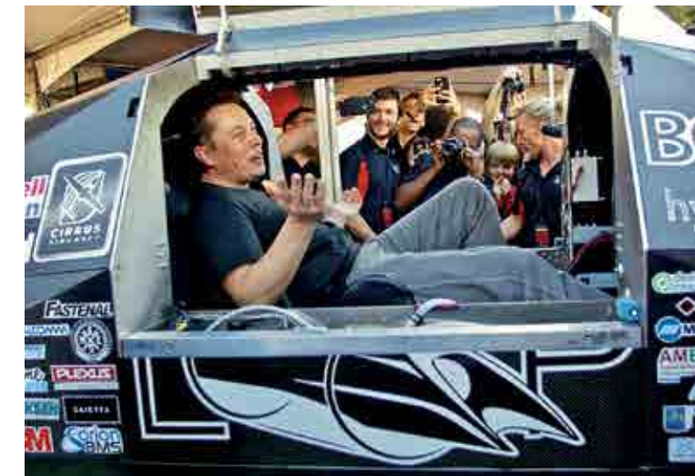
Elon Musk in a prototype of the Hyperloop pod

the present issues around batteries — their efficiency, cost, recharging and weight — will be sorted out soon. The fewer components in EVs (compared to ICE engines) eases manufacturing processes, and their minimal air pollution is a vital plus. Yet, there are concerns. One is the power required for recharging batteries: if this is being generated by coal-fired thermal plants, it is only the point of pollution that is being shifted, without any big reduction in foul air quality. Second is the problem resulting from disposal of old batteries, which can result in toxic chemicals. Third is the fact that current batteries and EVs require raw material (lithium, rare earths) which are all imported, with China enjoying a virtual monopoly. As always, technology could take care of many of these