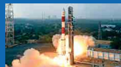
ISRO - Wind tunnel & Cryogenic Integrated Engine Testing Facility

Tata Projects Limited is one of India's fastest growing and most admired infrastructure companies. The company has expertise in executing large and complex urban and industrial infrastructure projects. Leveraging latest technology and advanced construction methods, Tata Projects has completed two breakthrough metro projects on schedule to boost economic activity, enhance connectivity, create jobs and accelerate the nation's progress.