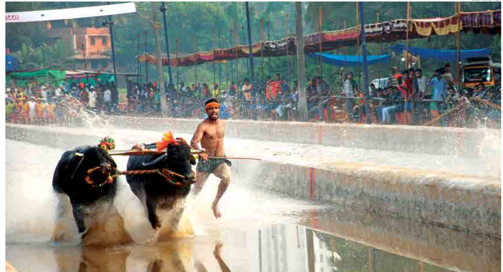
Buffaloes and their jockey race through a slushy track

pool for the bovines to wallow in during the heat. Racing buffaloes in training are rarely put to work in the fields.