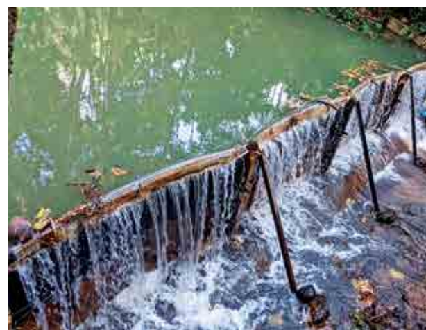
The check dams are stable and can withstand surprise showers

High labour costs, shortage of skilled labour, the crab menace and the fragility of the katta have made farmers look for more durable check dams.