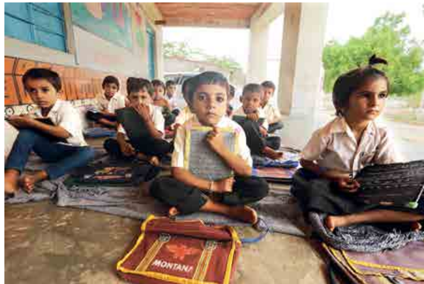
Children can't recall what they learnt in the previous class

An assessment of the learning levels of children when schools closed as well as of their current status was necessary to understand any such regression. The former was best done through teachers who have been deeply engaged with their learners, and thus had a reliable assessment of children's abilities when schools closed in March 2020. Therefore, this baseline assessment of children's learning levels, i.e. where they were assessed on specific abilities in language and mathematics when schools closed, was done based on a comprehensive analysis by the relevant teachers, aided by appropriate assessment tools. All abilities associated with the previous class were not assessed; a few abilities critical for further learning were carefully identified and assessed.