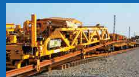
Eastern & Western Dedicated Freight Corridors (2000 track kms)