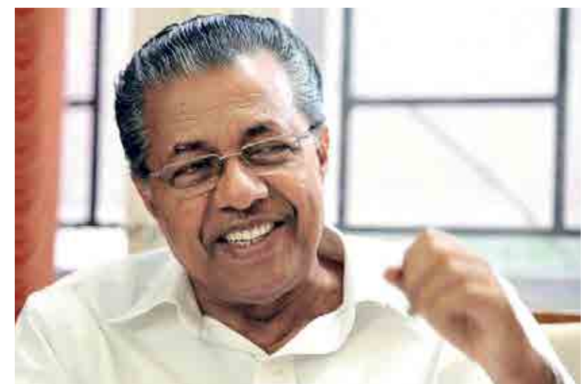
Chief Minister Pinarayi Vijayan: No anti-incumbency

For all its Hindu-Hindi nationalism the BJP has adapted itself to the regional and linguistic reality of Indian elections. Indeed, even in Gujarat, Narendra Modi has fully exploited this factor.