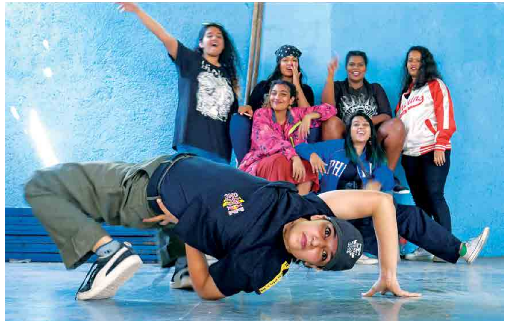
Wild Wild Women: 'The idea is to make a wholesome collective and broaden our horizons as a community powered by women'

These are modern avatars of what used to be secondhand bookshops. But do they have as much character and the same aura? In years gone by, a vibrant trade in secondhand books made it possible for old and used books to move seamlessly from homes to shops and into other homes. People at the secondhand end of the