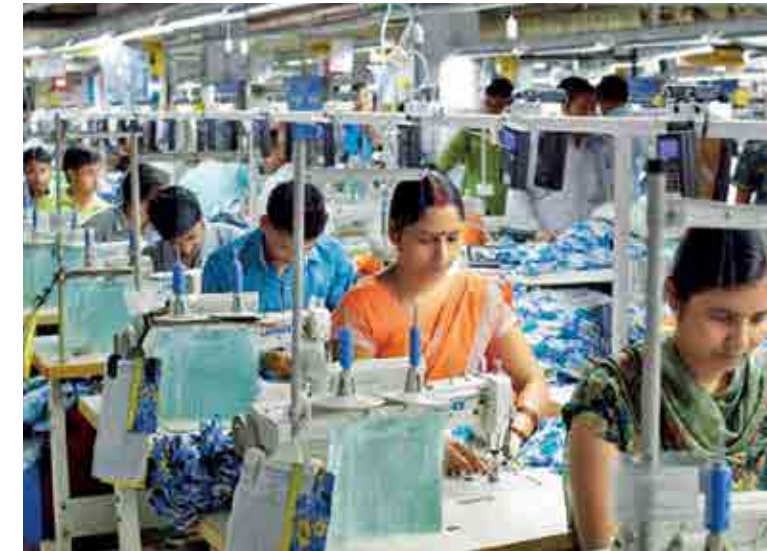
Garment workers at a factory in Gurugram